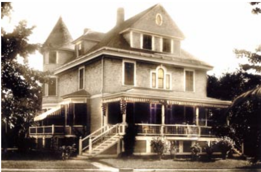
43 Magnolia Avenue, c. 1890.